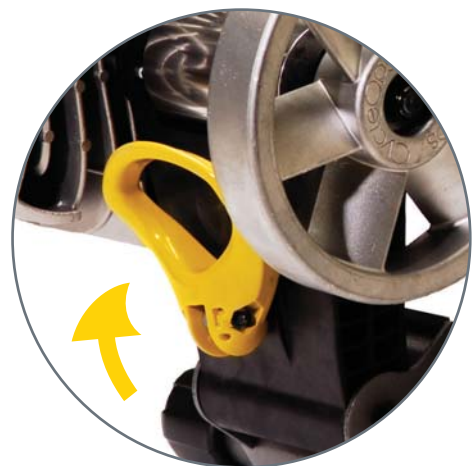
QUICK CAM LEVER FOR EASY RESISTANCE UNIT ATTACHMENT

★ Mag can be upgraded with purchase of remote shifter.