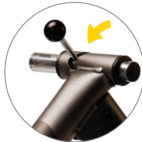
BOLT ACTION QUICK RELEASE LEVER